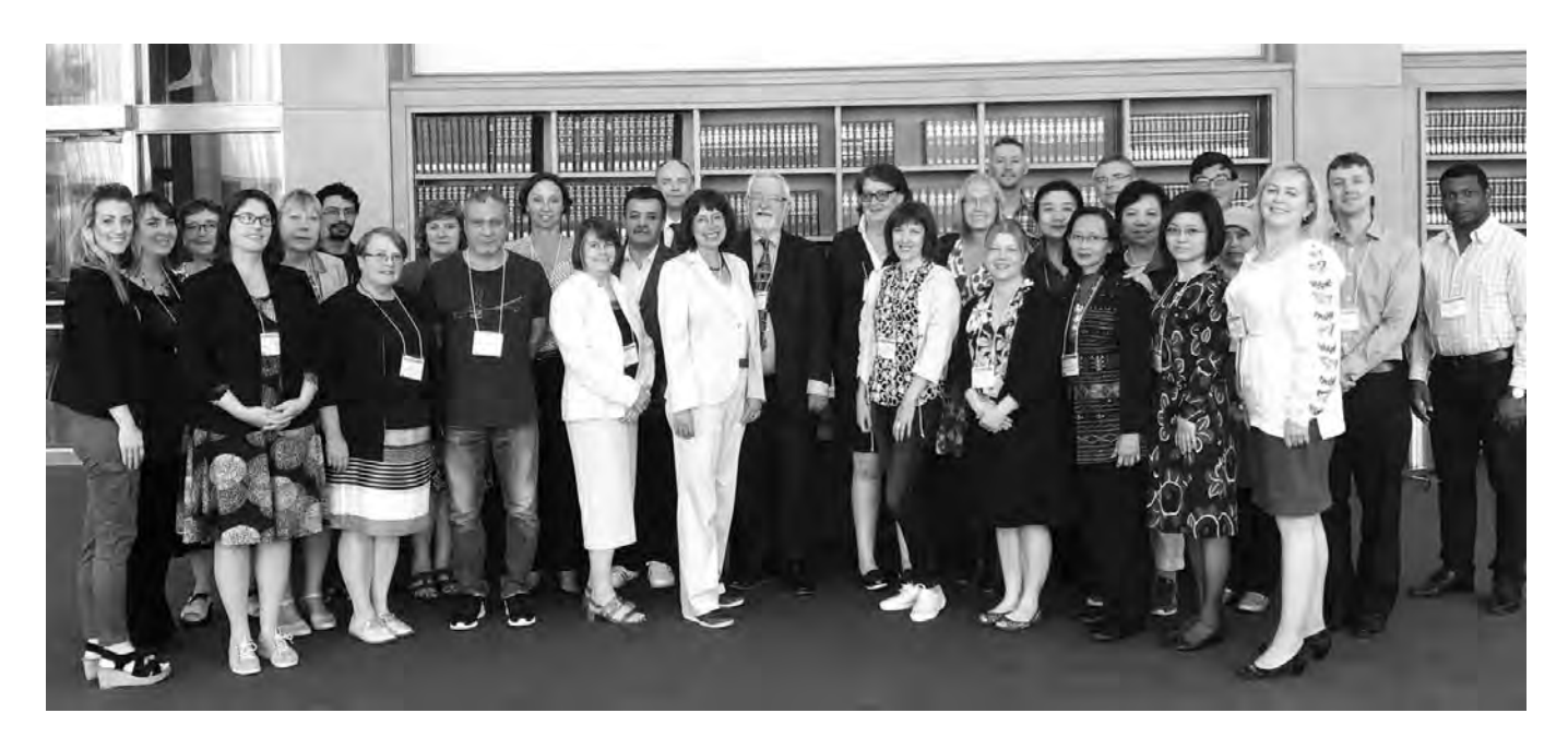
The participants of the 2017 Annual General Meeting

could be the ISMN Manager software and the IDNV (see his presentation on page 11).