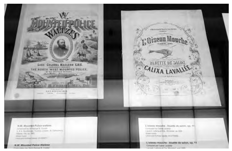
Detail of a display of Library and Archives Canada's music collection